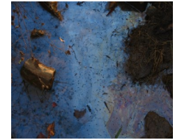
Oil and trash in a local stream that flows directly to the Catawba River

Remember, clean water begins with you! These 8 simple guidelines can greatly improve the quality of water we, and our neighbors, rely on.